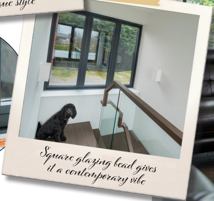
Square glazing bead gives it a contemporary vibe