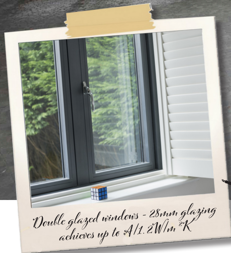
Double glazed windows - 28mm glazing achieves up to A/1.2W/m^2K

We would definitely recommend Residence Collection windows without hesitation! They have been a great investment for our project and represent excellent value for money."