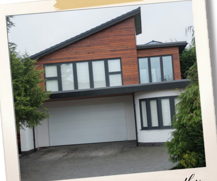
A mix of configurations gives this home a unique style